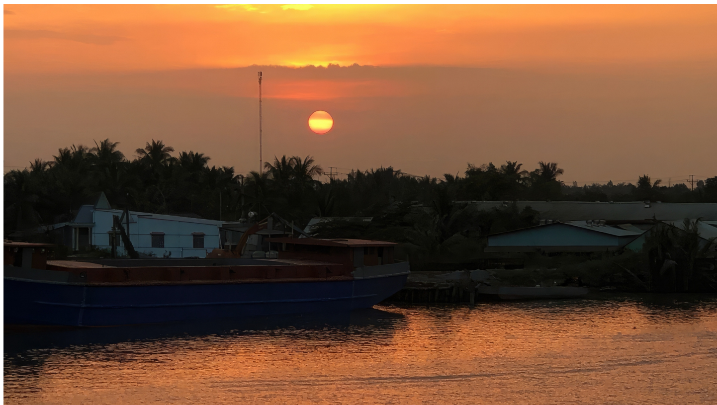
Romantic Mekong River in sunset

As the day gracefully concludes, delight in a sumptuous on-board dinner, complemented by the tranquil ambiance of the river. Retire to your snug cabin for a restful night, anticipating the myriad cultural encounters and natural wonders awaiting you on this immersive Mekong Delta experience.