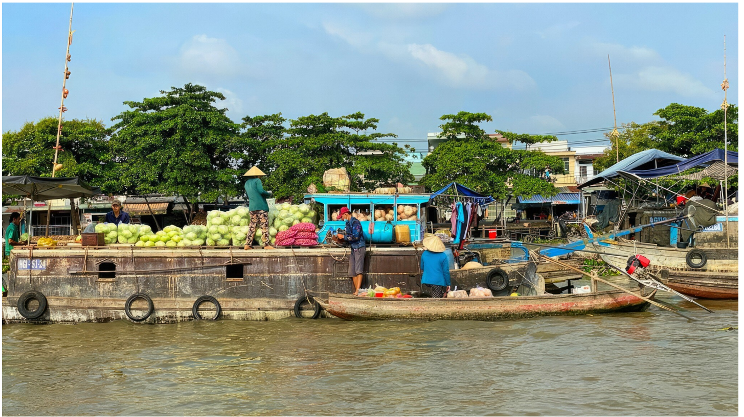
The active Cai Rang floating market

Following the market excursion, we disembark at 11:00 and then hit the road to transfer back to Saigon. Drop off at your hotel around 16:30 .